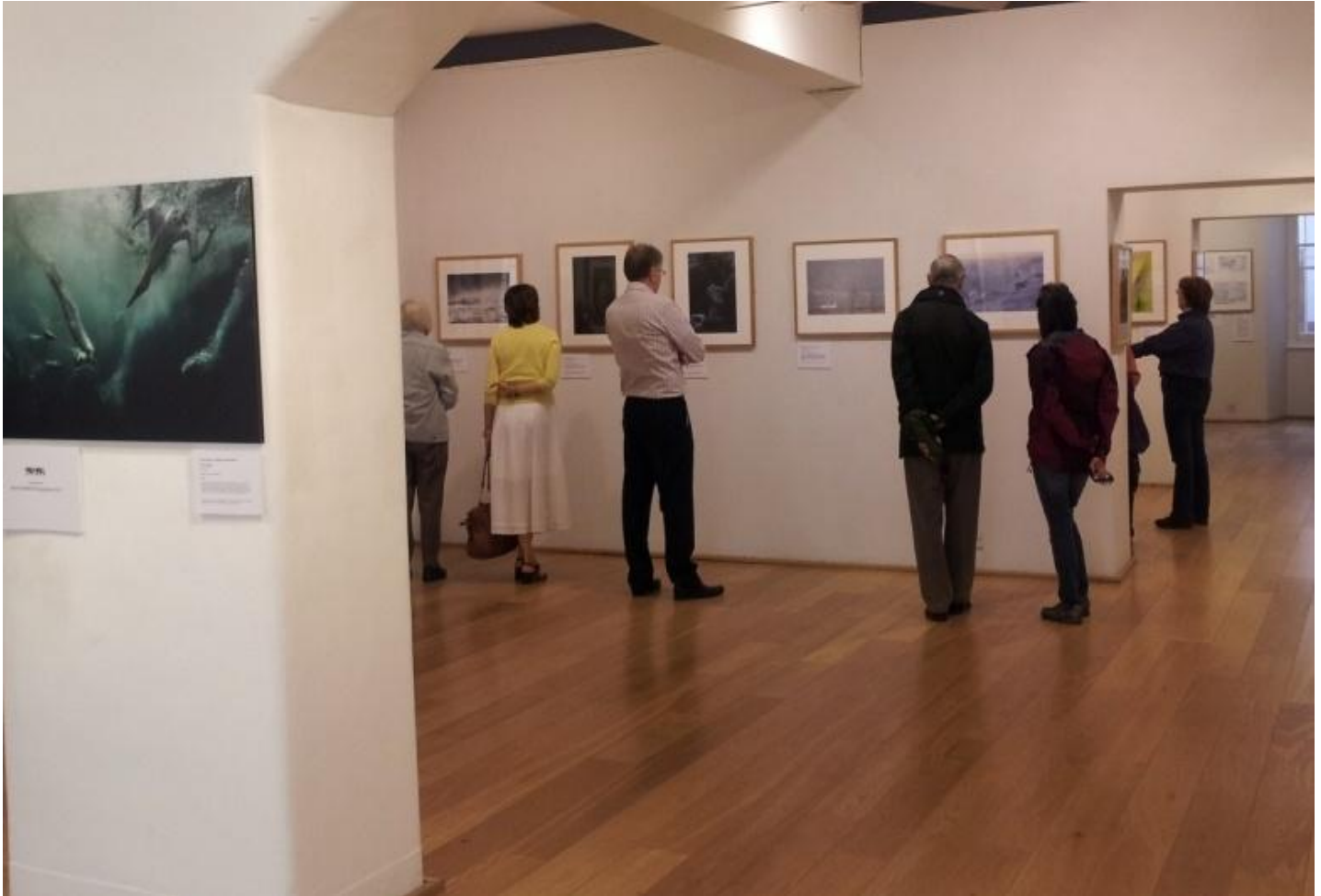
Exhibition on display at the Mall Galleries, London